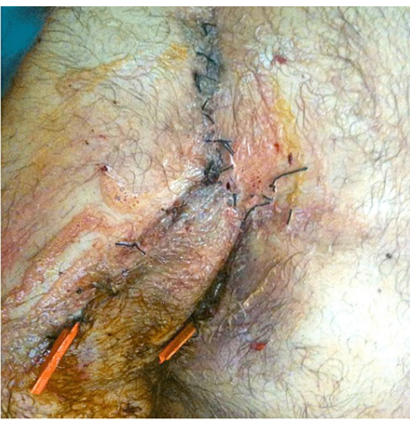
FIGURE 2: Images of patient 1 in the study

Left: An ulcerated, exfoliated mass in the sacral region with dominant growth towards the right side. Diffuse scarring can be seen after two previous operations for pilonidal disease (arrows). Right: The same patient after tumor excision and reconstruction using rotational flaps.